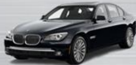
BMW F Series Program