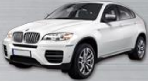
BMW OBD Key Match