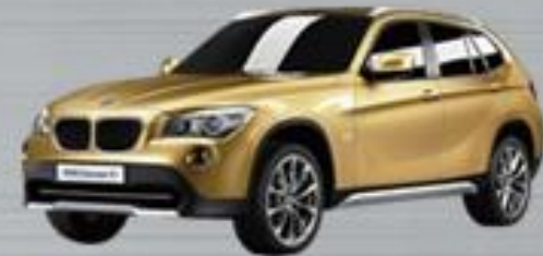
BMW Enable/Disable key