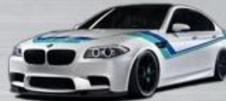
BMW F Series Coding