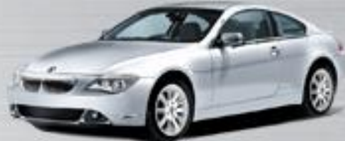
FEM/BDC Key Match