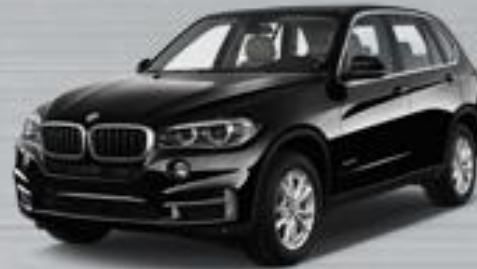
CAS4 Key Match