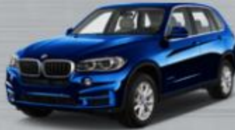
CAS3 Key Match